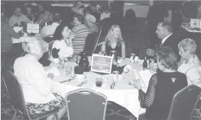
The Immanuel Lifeline Corporate Table enjoys the party!