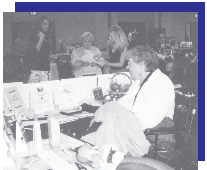
There are always a lot of great items to check out on the three silent auction tables.