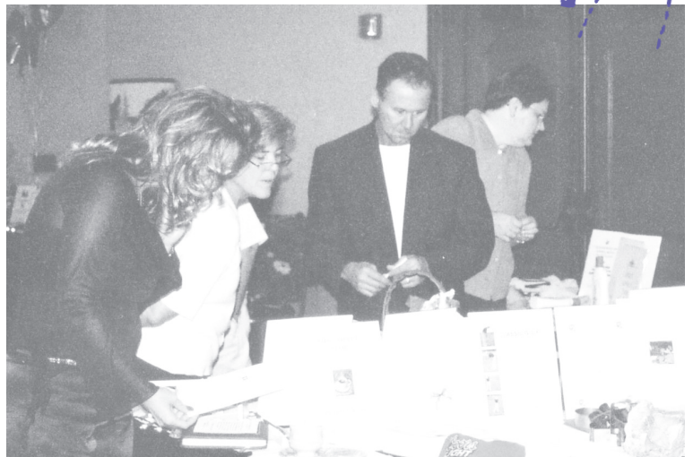
Look at all of this great stuff!!

A Big Thank You to our Corporate Tables: AFSCME Local 299, Aquila, Inc., Genesis Stained & Etched Glass/Global Travel, Great Plains Auto Body, Immanuel Lifeline, Jenco, Lozier Corporation, and Underwood Construction Management.