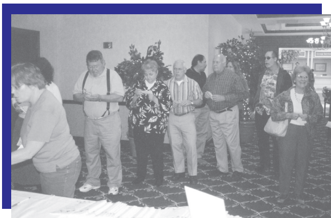
As the Omaha-Council Bluffs auction is set to begin, patrons patiently wait to get their hands on their bid numbers.

#4. The best reason to go to one of these auctions is to help people with disabilities continue to make strides. The money from the items you buy and the tickets you purchase all go to help the League with its mission of helping people with disabilities integrate into society. You are a star when you help the League make strides.